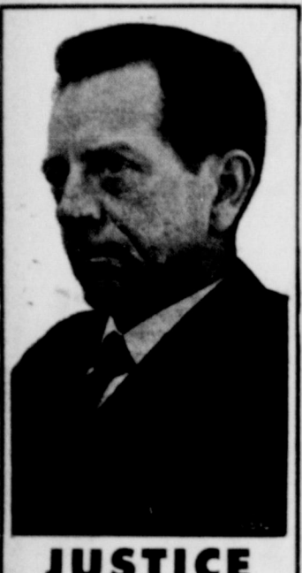
JUSTICE for the People of Texas J. EDWIN

baseball, track, horse shoes, in organization of the camp by pie;