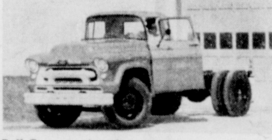
Ball-Gear steering that cuts friction and makes your job easier at every turn!