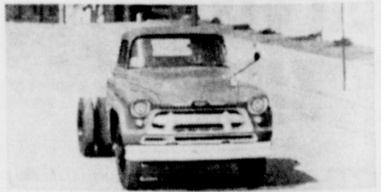
Automatic transmissions like Hydra-Matic* and revolutionary new Powermatic†.