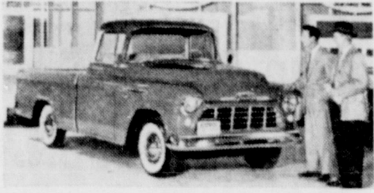
Advanced Work Styling—modern truck beauty that's good advertising for your business.