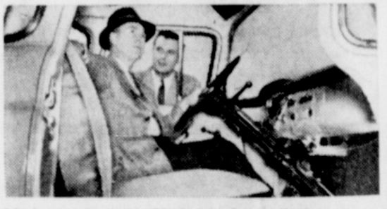
Modern cabs with High-Level ventilation, panoramic windshield and concealed Safety Steps.