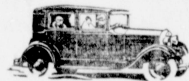
New Fordor Sedan 1925 (F.O.B. Detroit)