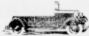
New Fordor Sedan $627 (F.O.B. Detroit)