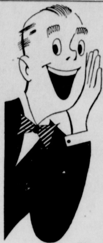
Right Reserved To Limit