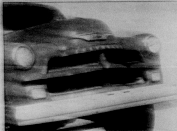
Distinctive front-end styling is keyed to added power and greater ruggedness of the completely re-engineered Chevrolet trucks. Features include new engine, optional automatic transmission, increased cab comfort and safety and easier load convenience.