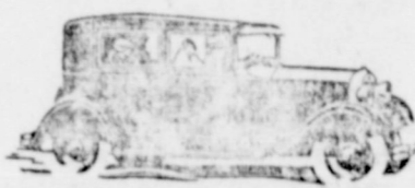
New Fordor Sedan 1929 (F.O.B. Detroit)