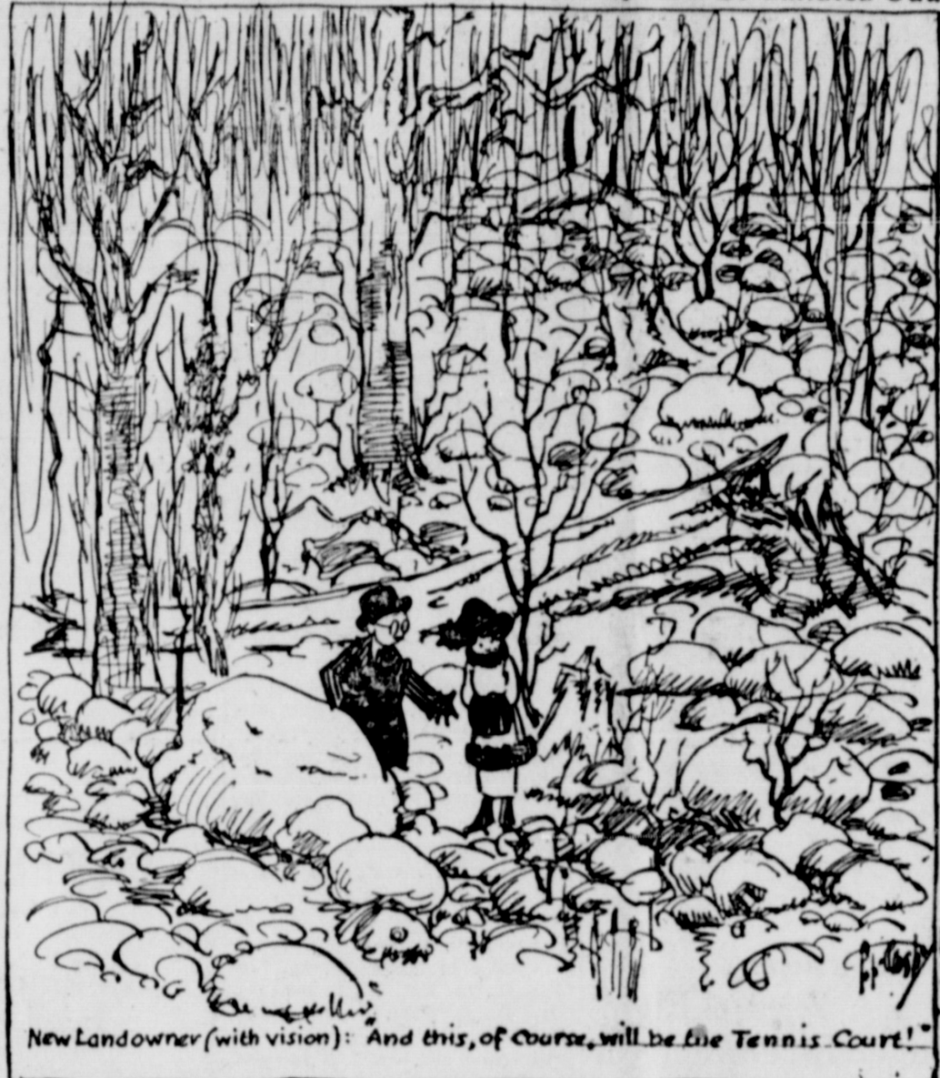
New Landowner (with vision): And this, of course, will be the Tennis Court!