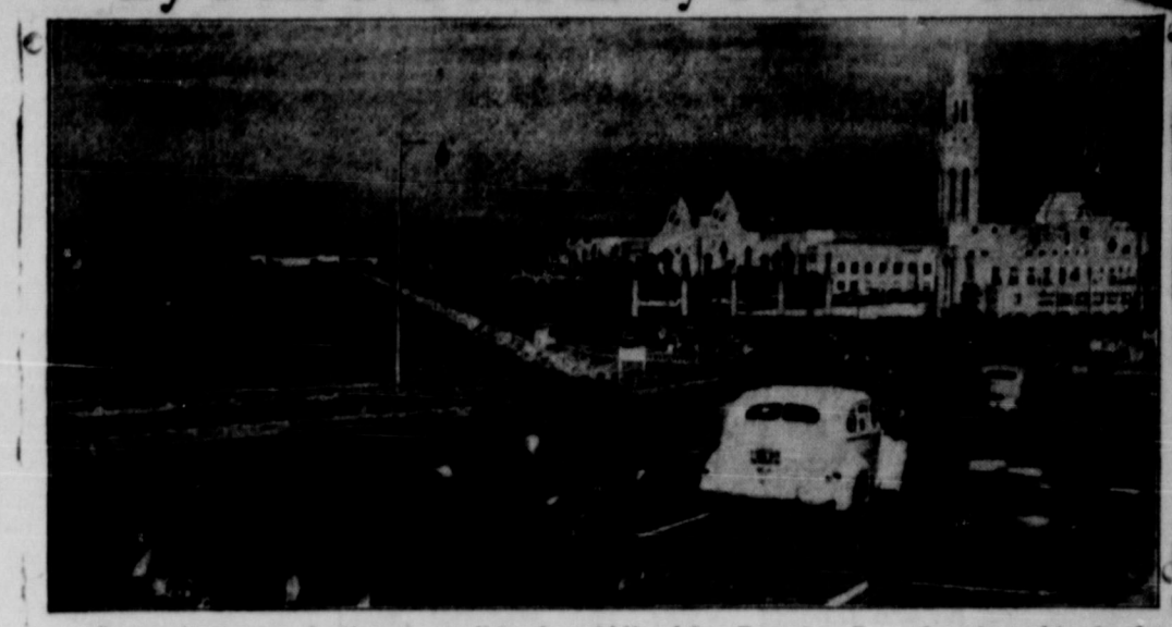
Descending upon the "magic city" in the middle of San Francisco Bay, gleaming white in sunlight and glowing in warm, pastel shades of glamorous color at night, crowds broke all atterance records for Expositions in early days on Treasure Island. Here hundreds of autos roll smoot through the entrance gates while a ferry boat (upper left) leaves the slip after carrying thousand from San Francisco to the World's Fair.