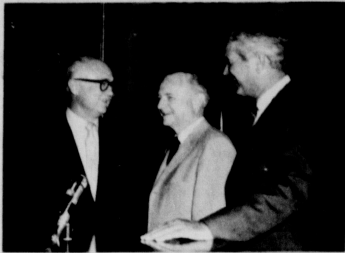
GOVERNOR PRESTON SMITH, left, and former Governors, Price Daniel and John Connally pictured as they discuss the Texas Water Plan prior to a Governor's Committee meeting in Austin Monday.