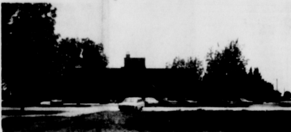
THE KNOX COUNTY HOSPITAL