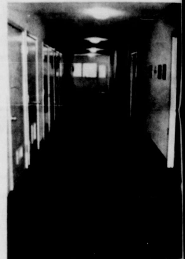
Fritzell-Eliand Wing covered in fire resistant carpet.