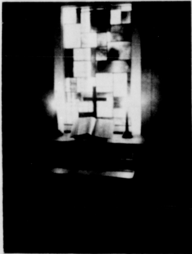
Prayer Room Completed in Spring, 1970.