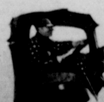
NEW FULL-TRIMMED DE LUXE CABS with clear-vision instrument panel for safe control

CHEVROLET The truck with the greatest pulling power in the entire low-price range . . . the safest truck that money can buy . . . and the most economical truck for all-round duty—that's the new 1936 Chevrolet!