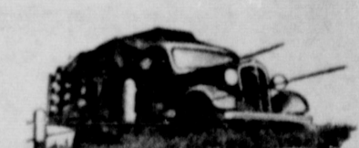
NEW HIGH-COMPRESSION VALVE-IN-HEAD ENGINE with increased horsepower, increased torque, greater economy in gas and oil

6% NEW MONEY-SAVING G.M.A.C. TIME PAYMENT PLAN Compare Chevrolet's low delivered prices and low monthly payments.