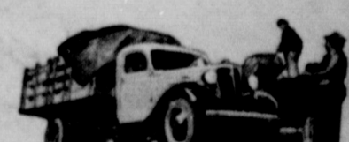
FULL-FLOATING REAR AXLE with barrel type wheel bearings on 1½-ton models