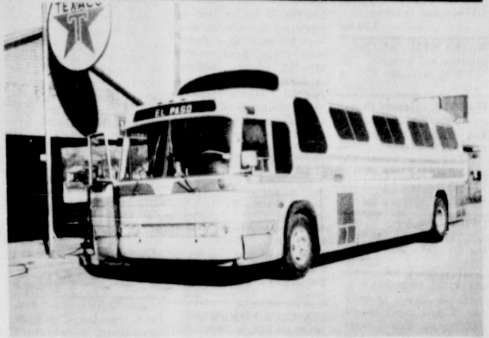
WITH THE ENDING OF THE BUS STRIKE LAST FRIDAY, bus service to Knox City and 44 other cities in Texas, Oklahoma, Kansas, and Arkansas was restored. Knox City residents were glad to have bus service again after ten weeks without busses.