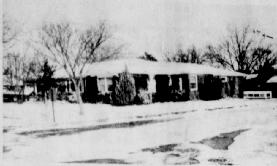
THIS SNOW SCENE AT THE R.G. HOWELL RESIDENCE ON South Fourth Street Sunday morning was typical of the way the town looked when residents awoke to daylight savings time and a blanket of snow.