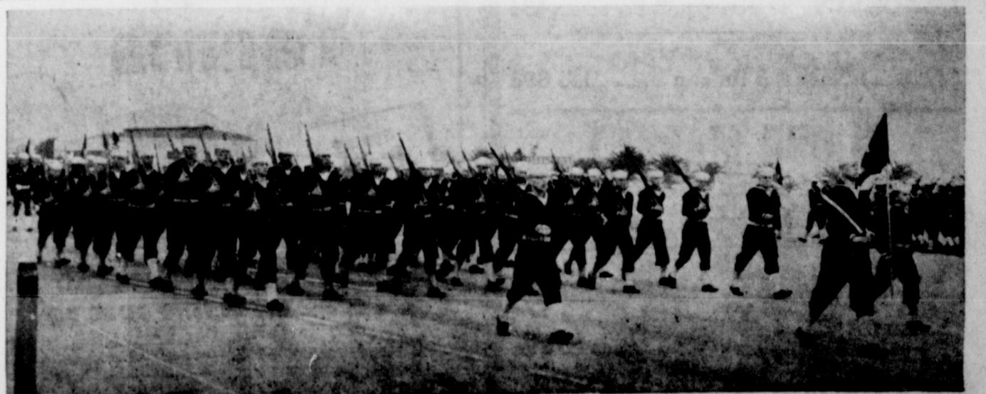
SAN DIEGO, Calif.—"All Texas" Navy recruit companies 210 and 215 pass in review during recruit graduation exercises June 30 at the Naval Training Center, San Diego, Calif. The graduation exercises, which marked the end of nine weeks of "Boot" training for the Texans, included a full dress parade and review before military officials and civilian dignitaries.

yearbook chairmen, and other interested members of the nationwide theme for all chapter study during the coming season. Various aspects of this theme, "Uniting Women Educators of the World in a Spiritual Fellowship", were explored and aids for making the yearbook were given by various members of the state program committee.