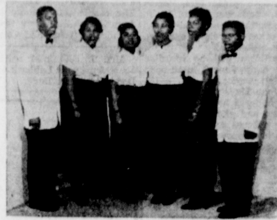
TO PRESENT PROGRAM—The nationally known "Spiritual Singers" from Southwestern Christian College of Terrell will make an appearance at the Knox City Church of Christ, located at 5th and Brooklyn streets, at 3:00 p. m. Sunday, June 3. These Negro singers are widely known for their excellence in presenting both spirituals and hymns. During the past two years they have made appearances before more than a million people in practically every state and in Canada. They are experienced radio and television artists. The public is cordially invited to hear them.