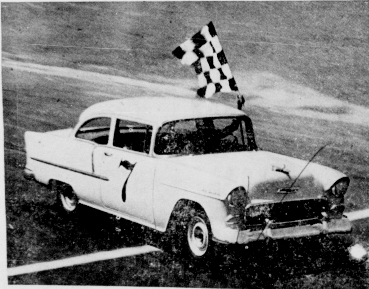
Great Features back up Chevrolet Performance: Body by Fisher—Ball-Race Steering—Outrigger Rear Springs—Anti-Dive Braking—12-Volt Electrical System—Nine Engine-Drive Choices.

Every checkered flag signals a Chevrolet victory in official 1955 stock car competition—not only against its own field but against many American and foreign high-priced cars, too!