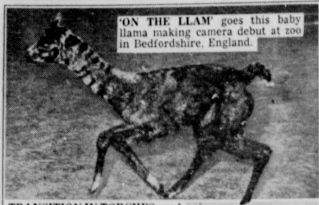
'ON THE LLAM' goes this baby llama making camera debut at zoo in Bedfordshire, England.