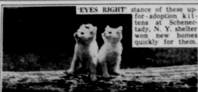
EYES RIGHT stance of these up-for-adoption kittens at Schenectady, N. Y. shelter won new homes quickly for them.