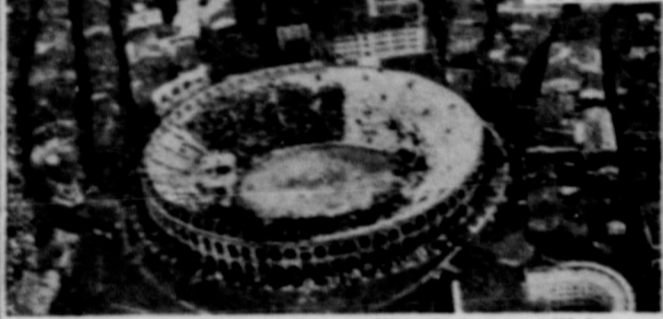
COLISEUM like Rome's, but, unlike that one, still in use is this at ancient (note narrow streets) Verona, Italy. Crowd here is toga-clad extras on hand for gladiatorial scene in a motion picture.