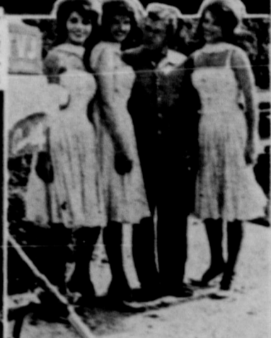
TRILLING TRIO , plus one: McGuire Sisters and Arthur Godfrey reunited as they tape scene in Florida for May 19 TV Special for Bulova.