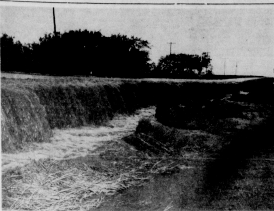
No, this isn't Niagara Falls, but it looked like it Saturday when the rains ran "China Draw", just over the pavement. The deluge cut away the shoulder of the road and endangered the pavement and the concrete culvert before the water receded.