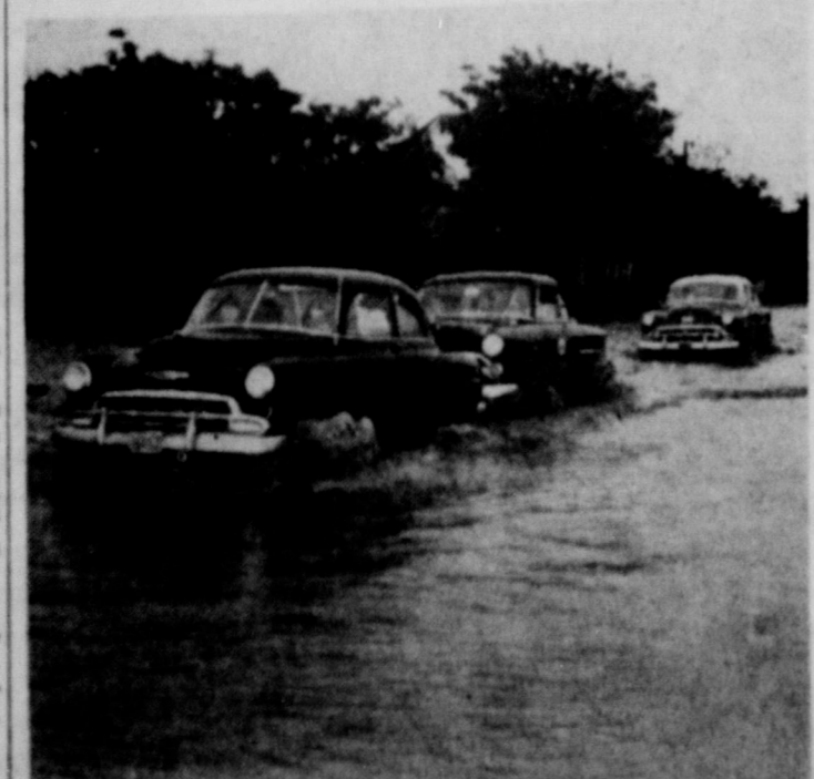
Cars on the Munday Highway drove through bumper-deep water following Saturday's torrential rain. When the water was highest, many vehicles "drowned out."