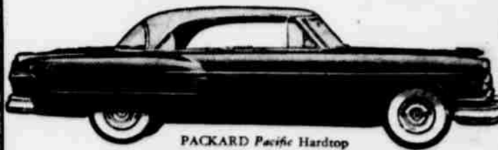
PACKARD Pacific Hardtop

Beginning tomorrow, and for a limited time only, your present car becomes a full year younger to us... and we'll give you a trade allowance that proves it! Don't let this wonderful opportunity go by! Come in and let us show you how easily you can step up to a beautiful Packard or Clipper. You'll be glad you did!