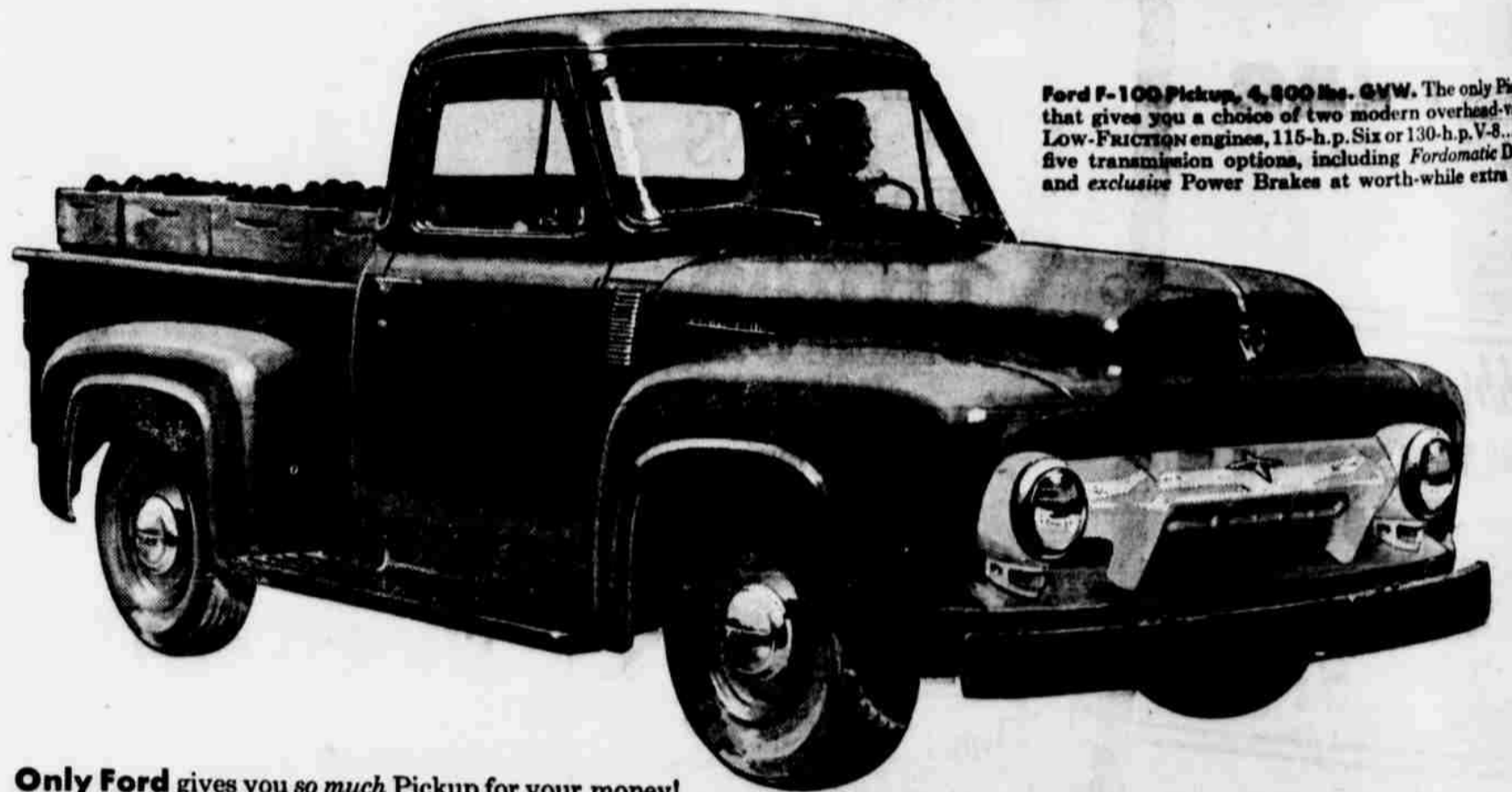
Ford F-100 Pickup, 4,500 lbs. GVW. The only Pickup that gives you a choice of two modern overhead-valve, Low-Friction engines, 115-h.p. Six or 130-h.p. V-8... plus five transmission options, including Fordomatic Drive, and exclusive Power Brakes at worth-while extra cost.