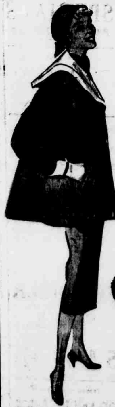
Left: Sailor-collared shortcoat with contrasting collar and cuffs in a superb wool-and-mohair fabric.