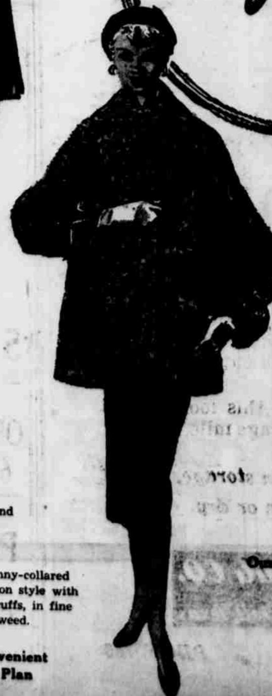
Right: Johnny-collared one-button style with turn-back cuffs, in fine wool tweed.