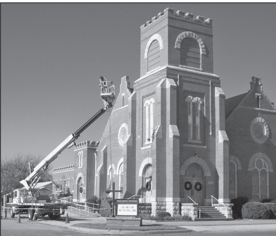
CHURCH WORK —This sky high crew is doing tuck-point work for the First United Methodist Church in Haskell. The project should continue this week.