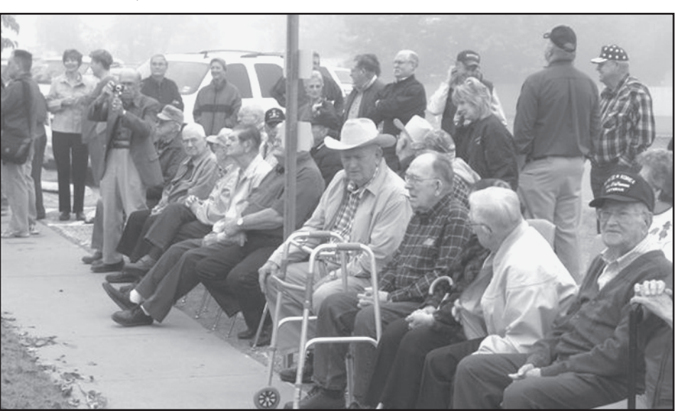
VETS HONORED-Haskell Elementary fifth grade students hosted a Veterans breakfast and program to honor and salute veterans.

Memorials may be made to the First United Methodist Church of Haskell or the charity of your choice.