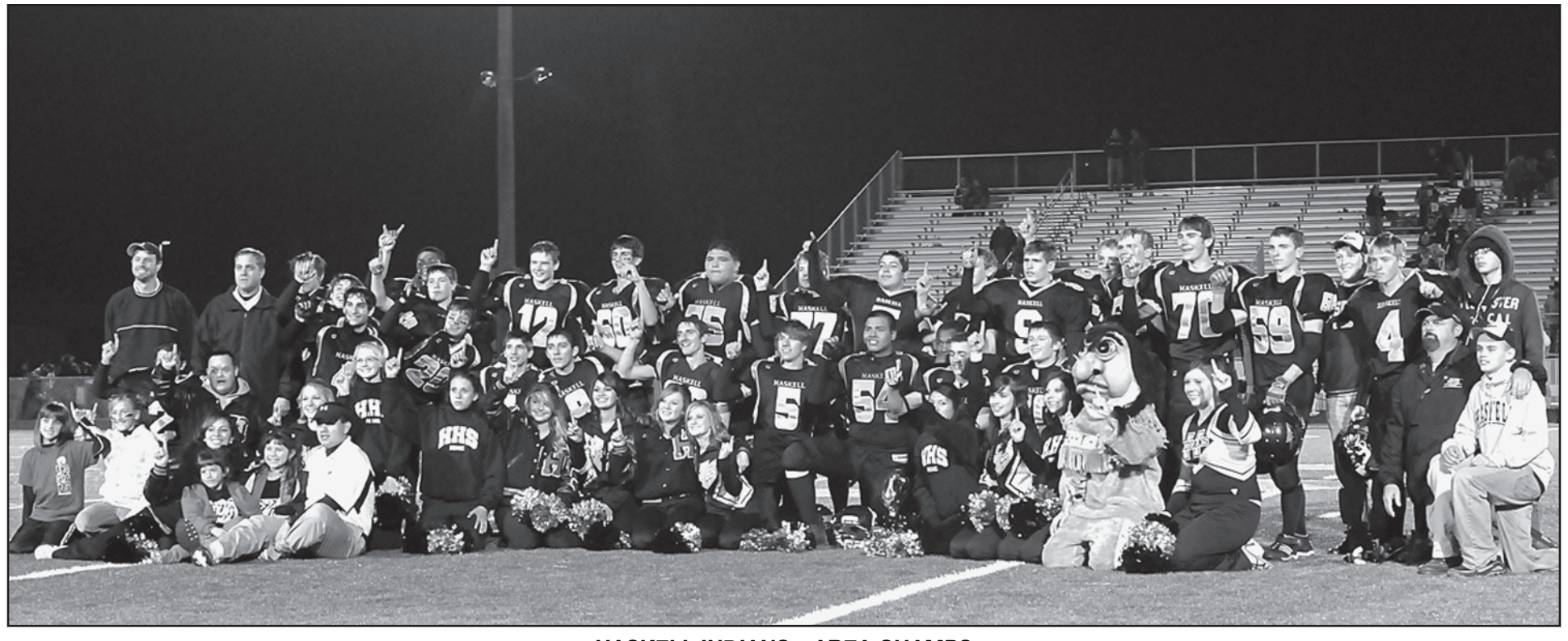
HASKELL INDIANS - AREA CHAMPS