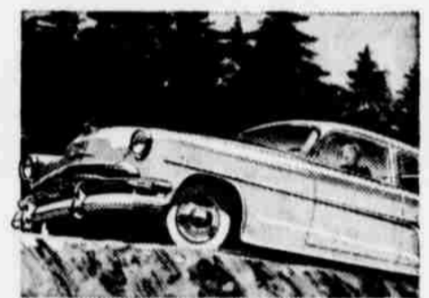
FINE-CAR PERFORMANCE—More power punch for traffic and passing, big-car steadiness and sports car handling ease assure matchless performance thrills.