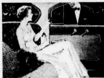
FINE-CAR SIZE AND LUXURY—Here is the key to Pontiac's great distinction, superlative comfort and remarkable roadability. It's as big as top-priced cars!