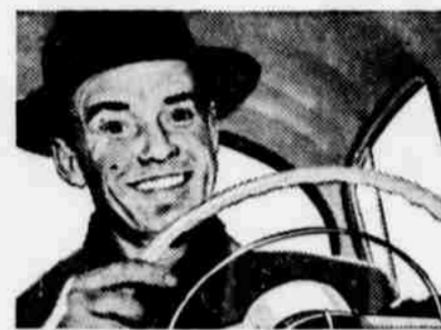
FINE-CAR DRIVING CONVENIENCES—Pontiac provides Dual-Range Hydramatic, Power Brakes, Power Steering, Comfort-Control Seat at extra cost.