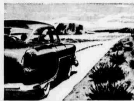
FINE-CAR DEPENDABILITY—No car at any price excels Pontiac for reliability. You can drive it as hard and as long as you like with perfect confidence.