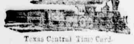
Texas Central Time Card.

Passenger train leaves Albany daily at 6:30 A. M. Arrives at Cisco 7:50 A. M. Dublin 10:15 A. M. Morgan 12:37 P. M. Waco 3:10 P. M.