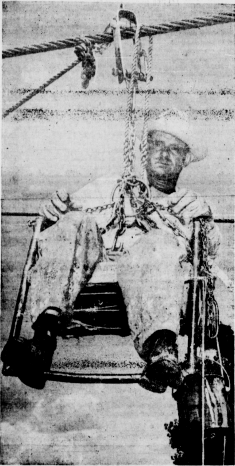
Invented by members of Lone Star Gas paint crew this boatswain's chair enables them to paint pipeline suspension bridge rods in less time than they used to require. It was designed primarily for the safety of the painter.