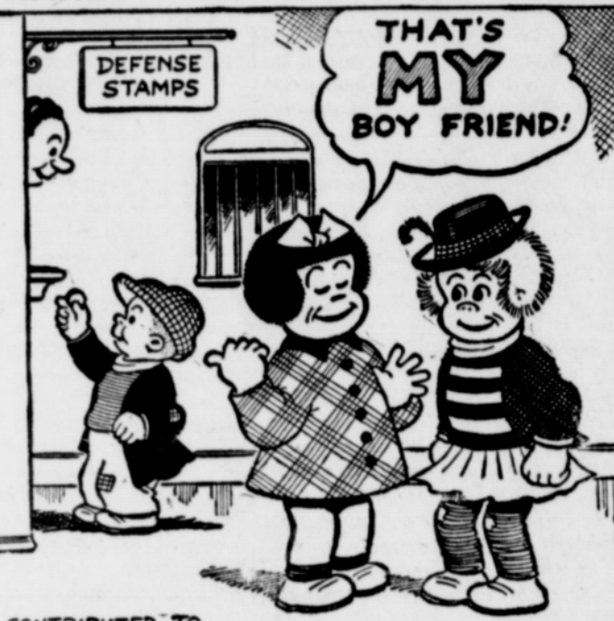
CONTRIBUTED TO THE DEFENSE SAVINGS PROGRAM