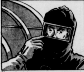
3. Frankenstein? No, just another G-E worker. His job is sandblasting big turbine castings for Uncle Sam's ships at one of the General Electric plants.