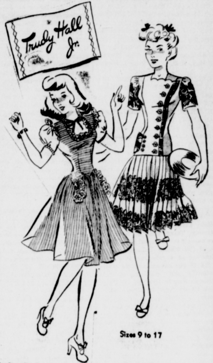
Sizes 9 to 17

That's the new Junior Dress name that's on the lips and backs of the cutest tricks all over the country. Join up with this fashion parade by seeing our brand new summer washables that have just arrived.