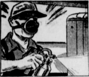
1. Not a gas mask, but a special nose mask to guard his breathing, is worn by this spray painter at his job in one of the General Electric plants.

America's "soldiers of production," men and women working in the plants of American industry, have their uniforms, too. Some uniforms worn by G-E workers on vital production jobs are shown below.