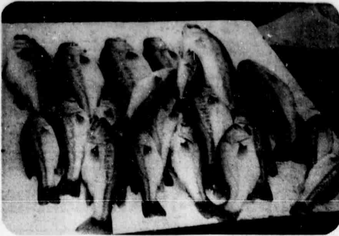
BOBBY WHISENHUNT AND DAVID BURSON caught these 20 bass last Saturday at Lake Stamford. The largest of the fish weighed 6½ pounds and the total weight of the 20 was 55 pounds. Many other local fishermen have also been bringing home impressive stringers of fish and are expected to do so for some time while the fish are spawning.