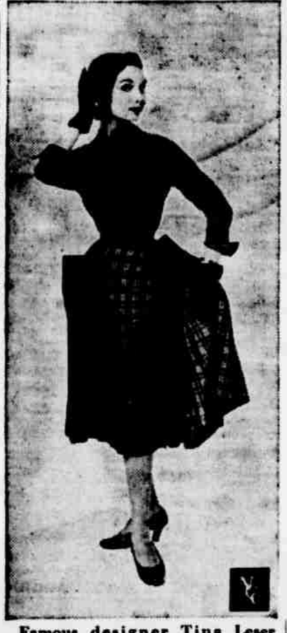
Famous designer Tina Leser picks cotton for this striking winter design. Using a menwear cotton suiting in bright red with black and white plaid, she created this versatile costume for the smart sophisticated. Cotton menwear suitings are seen frequently in this season's designer collections, the National Cotton Council reports.