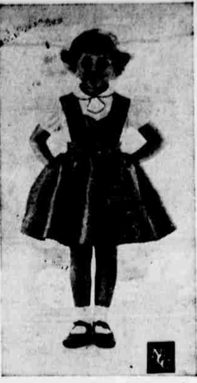
Taking a cue from the big girls, who are wearing bouffant skirts and crinoline petticoats this winter, this fashionable little miss wears her new dress with a full, full skirt. Her chic frock by Trude of California is of black and white pinpoint checked cotton with red and green trim.