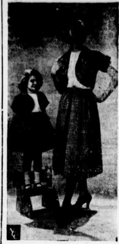
She's a big girl now that she has a trim little cotton bolero outfit just like mother's! Mother and daughter both like the popular bolero style and especially this one by Jack Borgonicht—it's made of wrinkle-resistant cotton. The checked bolero serves double duty, for it reverses to a solid cotton that can be worn outside.