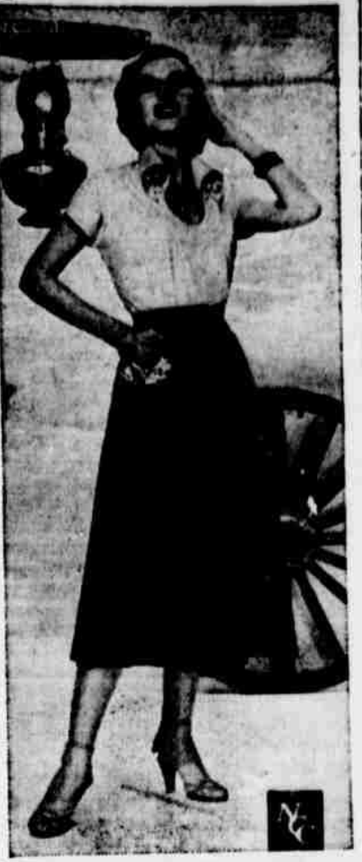
Clifford of del Mar chooses a luxurious cotton in two shades of green for an ensemble called Posie Pairer. The easy skirt and scoop-neck blouse have detachable flowers tucked in the horseshoe pocket and smart, rolled collar.