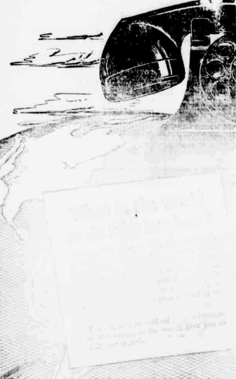
Southwestern Associated Telephone Co.

Why don't you get that wonderful relief that HADACOL brings? It's the only relief that relieves the real cause of your stomach distress, indigestion, gas, constipation, neuritis, and a general run-down condition. HADACOL is a great 'builder-upper' for sick, nervous, puny kids whose systems lack precious Vitamins B1, B2, Iron and Niacin. A big improvement in their well-being is often noticed within a few days' time after taking the great new HADACOL.