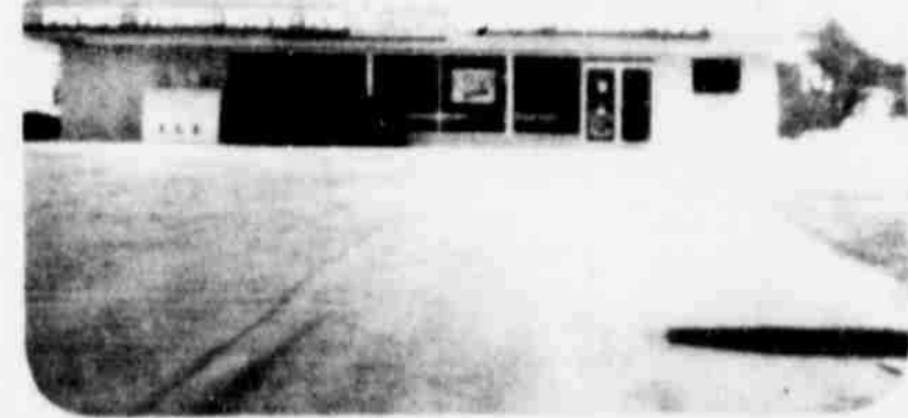
OPENING FRIDAY —the Colonial Food Store will take its place as a new business in Haskell. The Haskell store will be store No. 46 in the rapidly expanding chain that is based in San Angelo.

The Free Press will be closed December 25, 26, and 27 for the Christmas holidays, and ad deadline for the January 1, issue will be noon, December 30.