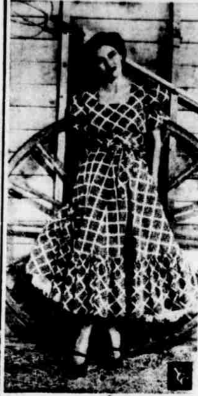
Cyd Crisne, graceful MGM dancing star, takes a "busman's holiday" and enjoys square dancing in her off-hours.