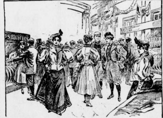
COSTUMES SEEN AT A RECENT 'CYCLE SHOW.

suspender so that it will not lose its shape. The big sleeves are carefully picked out and left perfectly smooth. And this takes a lot of time, but it pays in the long run, for such a woman is certain to look always the well-groomed woman, provided she is as careful of her body as she is of her gowns.