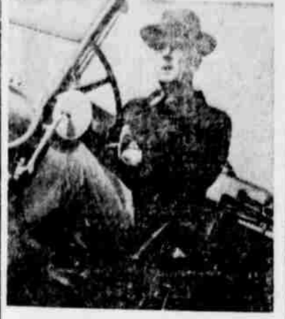
Adm. William H. Standley, retired U. S. naval chief, now ambassador to Russia, is shown behind the wheel of a jeep during a recent inspection tour of an ordnance repair depot somewhere in the Middle East. Picture was taken while Standley was en route to Moscow to return to his post, after important conferences.