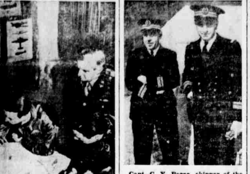
Capt. C. Y. Perzo, skipper of the Fantasque, and Capt. D. M. Sala, skipper of the Terrible, French light cruisers, are shown in Boston after perilous trip from Dakar, French West Africa.