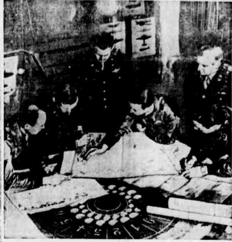
The roulette table in this old gambling casino in Tunisia is the plotting room for planning the air raid on the Axis-held El Aouina field, Tunisia. This was prior to the great tank battle of Kasserine Pass, in which American armored forces, after serious reverses, hammered back Rommel's dangerous thrust westward towards Tebessa.