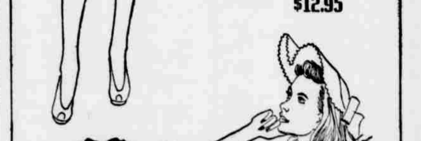
"Bib-n-Tucker" A slim torso dress in Filipino Rayon Crepe. In American Navy, Black. Sizes 11 to 15. $12.95