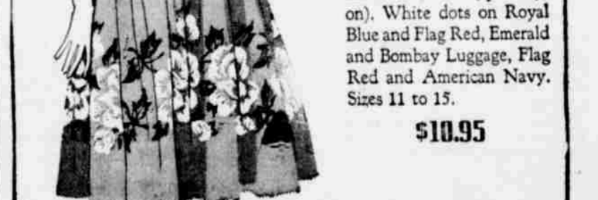
"Dots on Duty" A two-piece detachable dickey dress in contrasting shades of Ruffin (spun rayon). White dots on Royal Blue and Flag Red, Emerald and Bombay Luggage, Flag Red and American Navy. Sizes 11 to 15. $10.95