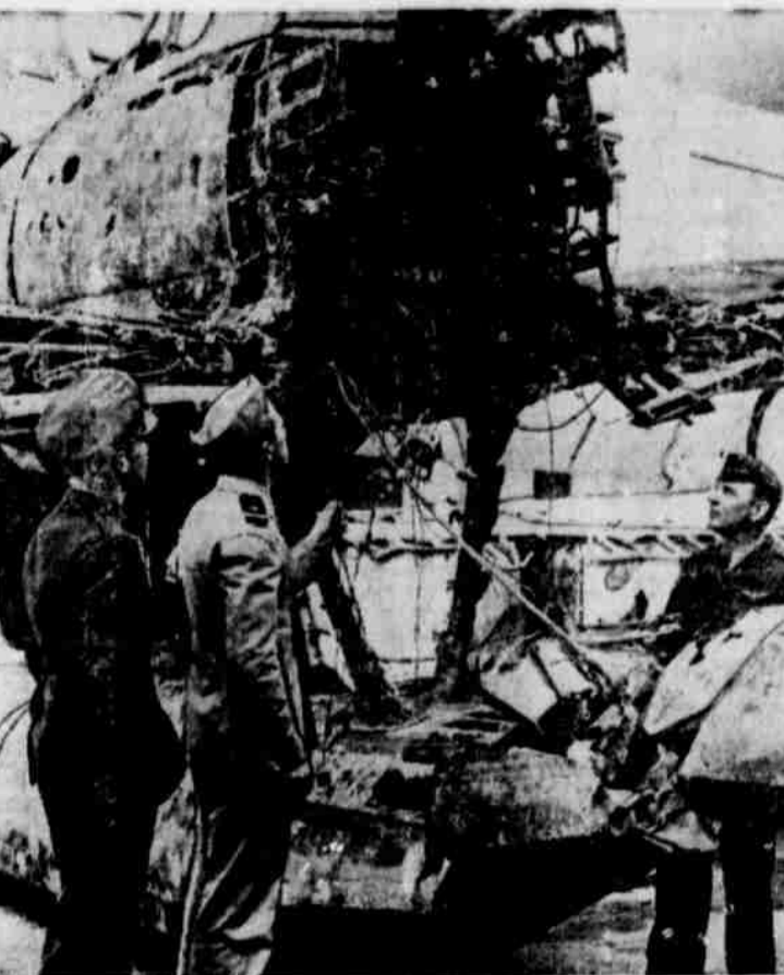
The Alameda naval air base, California, had a visitation of Japanese float-type Zeros, but no bombs were dropped. The planes, in various stages of disrepair, were shot down in the war zone and brought back for such purposes as the navy department may see fit to put them to. Photo shows a sample of what happens to these frail Japanese craft when they come under the guns of U. S. forces in the Pacific.