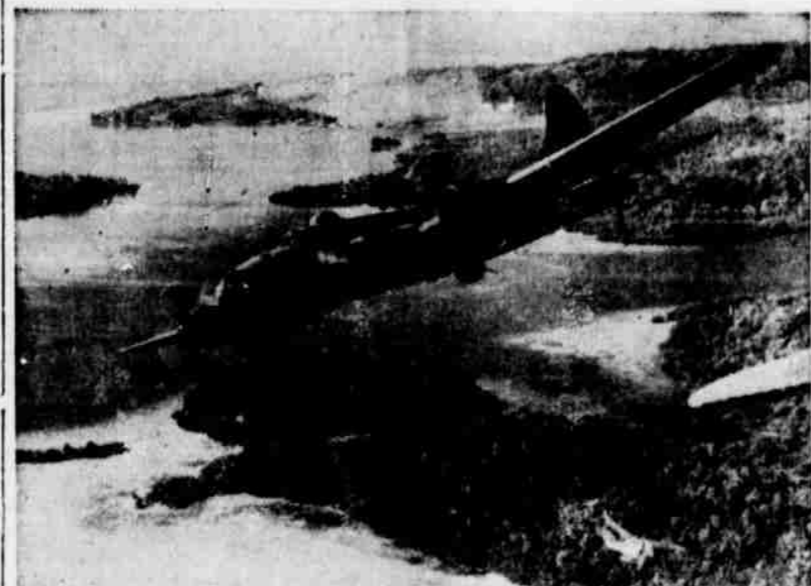
Leaving fire and destruction in their wake, U. S. army Flying Fortresses carry out a bombing sortie on Japanese installations on Gizo Island in the Solomons. The raid was part of a triple-pronged aerial thrust against the enemy during the fight for Guadalcanal. The starboard wing of the Flying Fortress from which a U. S. navy photographer snapped this picture is visible at the extreme right.