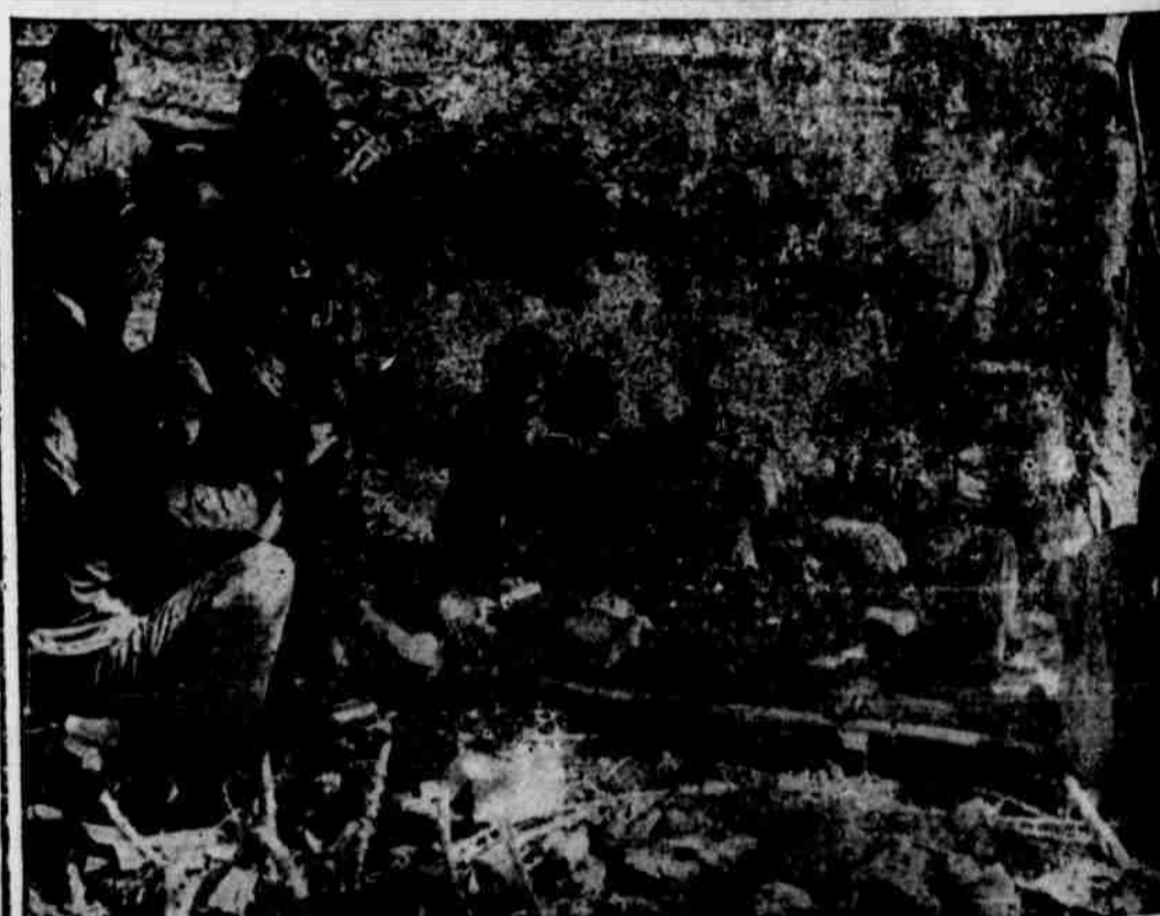
Navy doctors and corpsmen treat wounded Marines at this front line first aid station. The center is receiving blood plasma. There were many such stations on Soloman and all made possible through War Bond purchases.

OVER 1400 HASKELL COUNTY BOYS ARE IN SERVICE, MANY THEM SERVING IN THE SOUTH PACIFIC WHERE THIS PICTURE WAS TAKEN. YOU CAN HELP THEM ON THE HOME FRONT BY BUYING