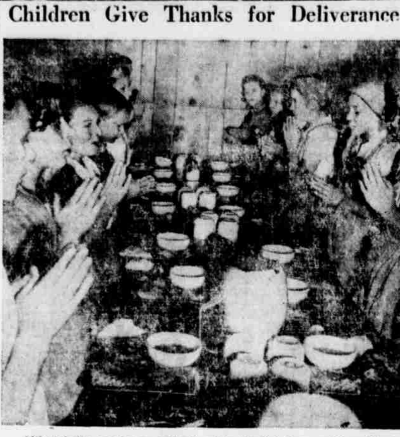
Although the words are not uttered in English they could readily be understood by a casual observer as these Polish refugee children say grace at a camp in Santa Anita, Calif. They are some of the 300 Polish refugee children who are on their way to Mexico where they will remain for the duration as wards of the Polish government in exile.