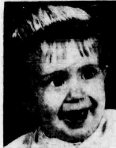
"Johnny's in the Parade!"

CROSS is American instrument Pen and Pencil under precision sure quality. They are balanced by writing ease and ideally guaranteed. They are Kt. Gold filled and No. 1 gift selection. Free Press.