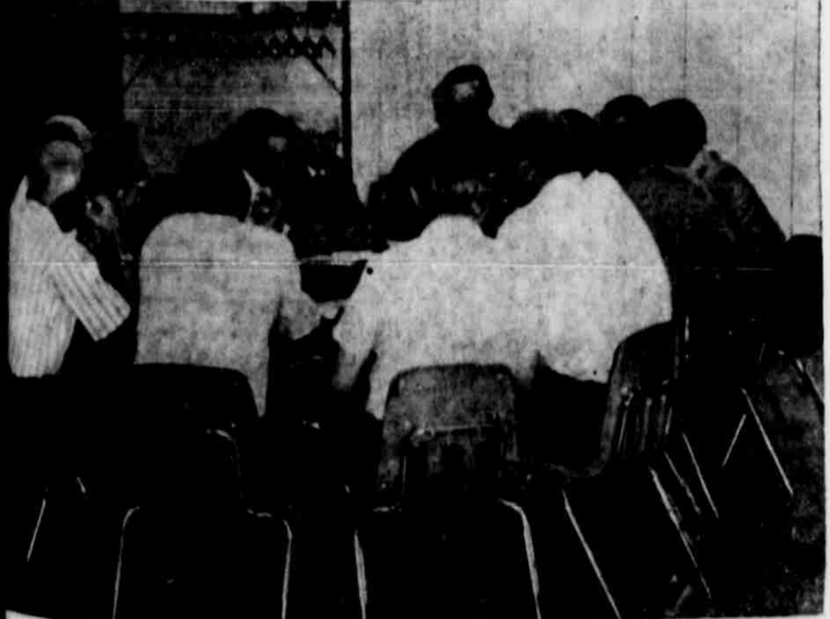
TABLE DISCUSSION—The Board of Directors of Haskell Industrial Foundation met on evening to open bids on the new Herman Marcus building. Low bid was $137,988.00 by construction Company of Graham.

dine in the new restaurant 39 stor- on the Hyatt Regen- only make a 300 de- in view the Houston restaurant turns years . . . all the while you're watch in fascination as