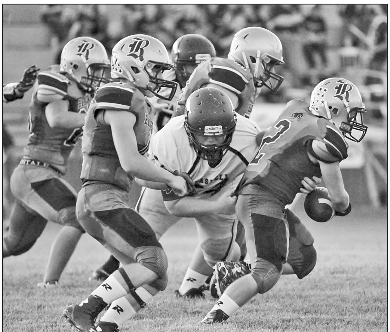
stopped a Ranger Bulldog last Friday night. The Baird Fri., Sept. 11 at 7:30 p.m. in Indian Stadium.

The JV Indians defeated Cross Plains 30-26.