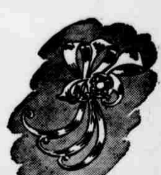
LAPEL PINS with Jewel Centers

Pin of yellow gold ribbons with jewelry center.