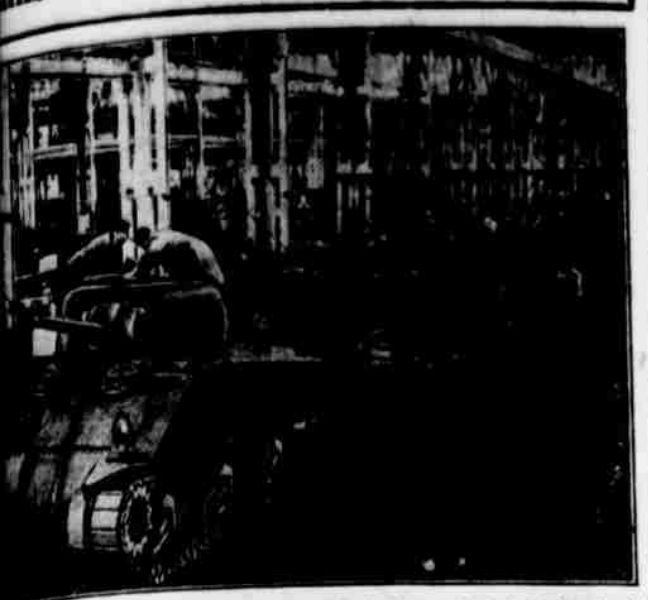
Army's latest type tank, the all-welded 30-ton M-4, is being built on an assembly line such as is shown above. The big tank in the foreground is the first one off the line.