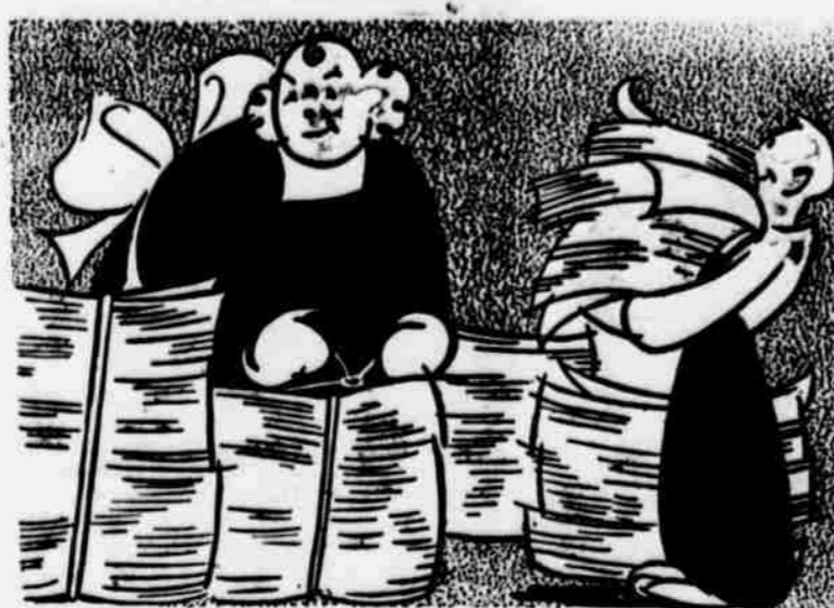
SELL your old newspapers and magazines. Also, old rags and rubber articles. The Salvage for Victory program needs them.