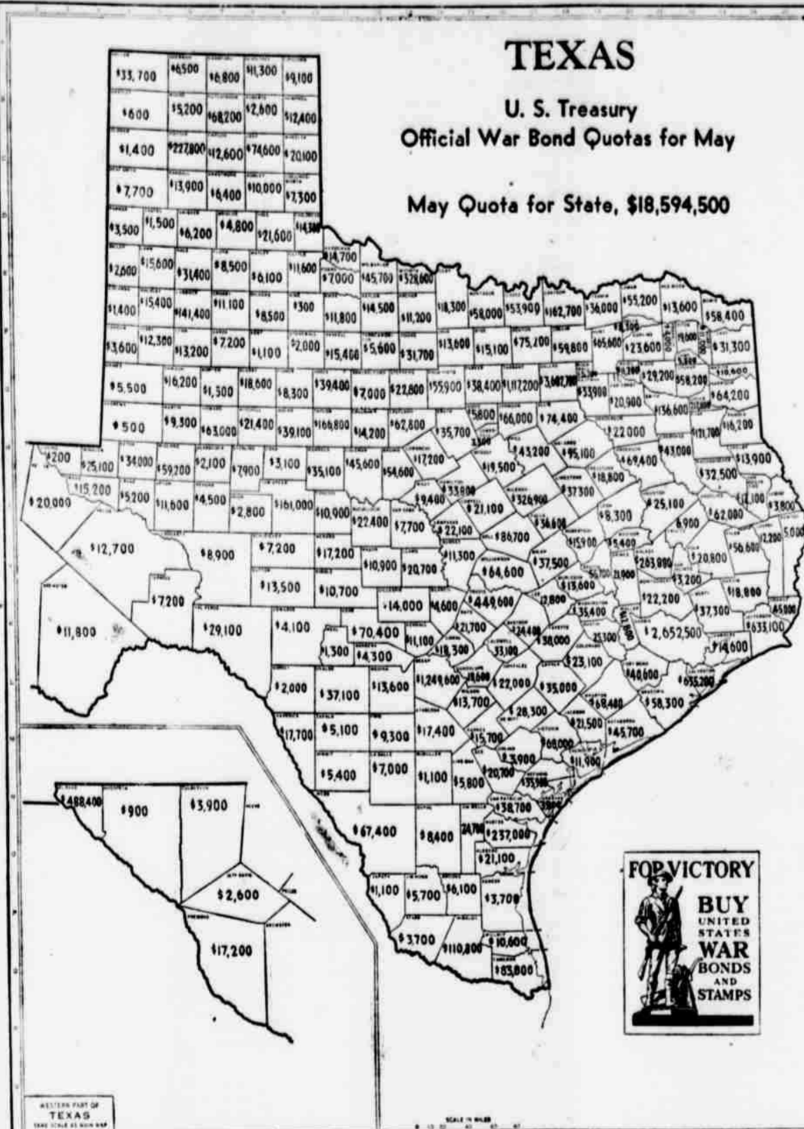
The above map of Texas shows the War Bond quotas, by counties, for the month of May, 1942. Total War Bond quota for the State is $18,594,500.