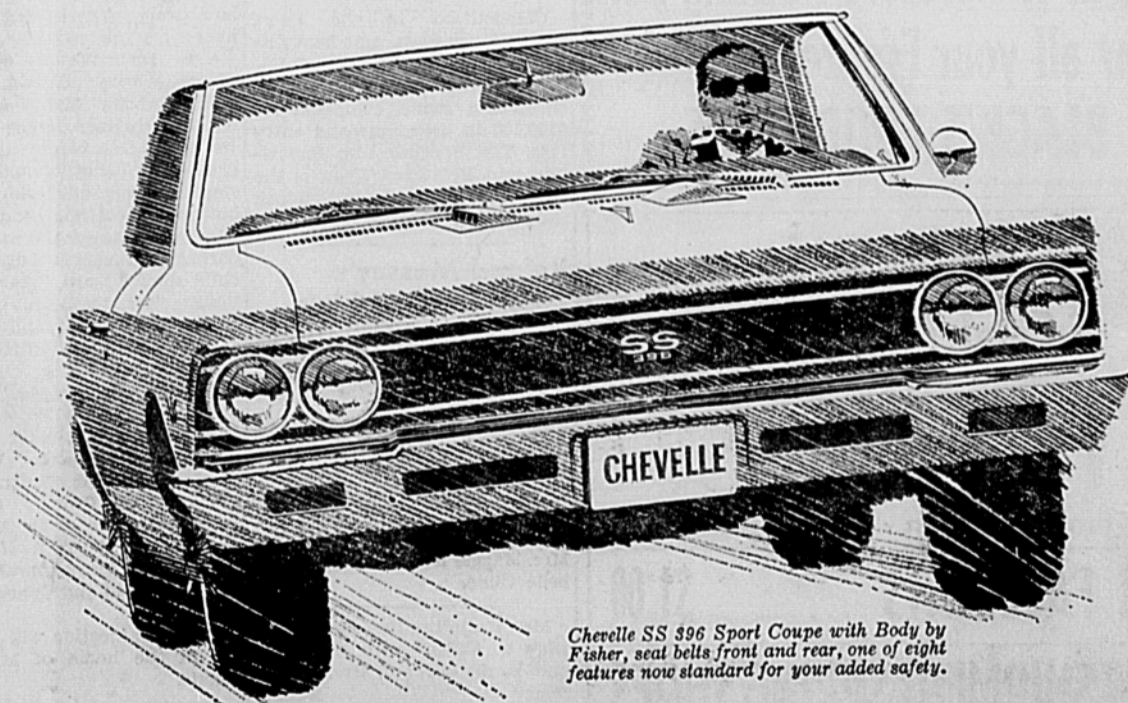
Chevelle SS 396 Sport Coupe with Body by Fisher, seat belts front and rear, one of eight features now standard for your added safety.

For the guy who'd rather drive than fly: Chevelle SS 396