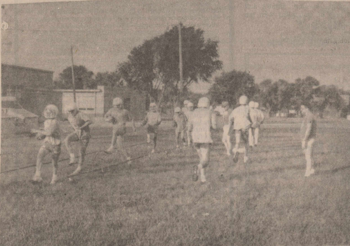
Stratford Elks started two a days this week. Gearing up for a great year.