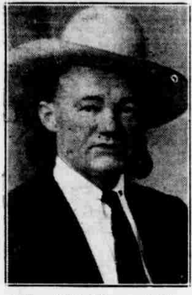
The Old Man of the Mountain and His Variety Entertainers