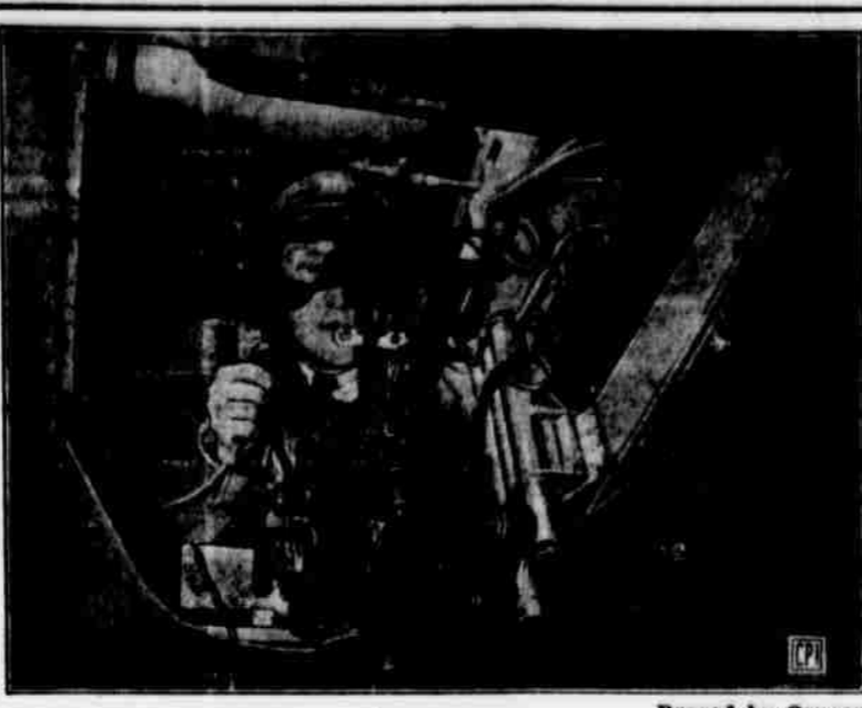
Passed by Censor