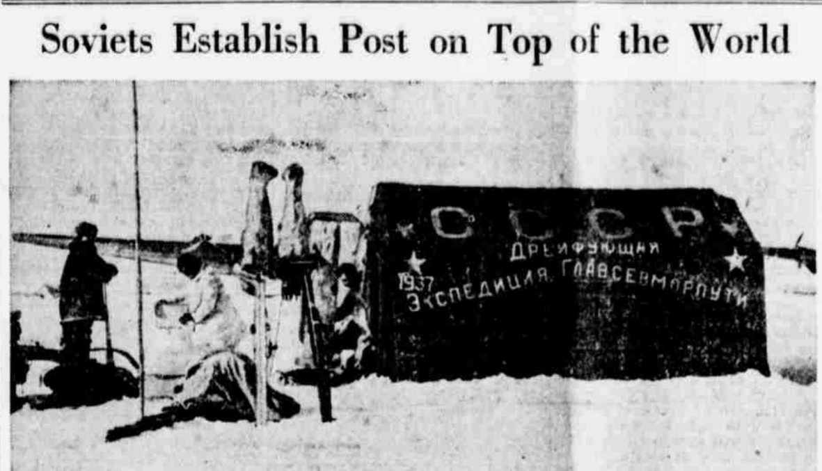
This photograph, brought back by returning members of the Soviet aerial expedition to the North pole, shows the camp established at the pole by the expedition. Parts of the world, may be seen in background. Four members of the expedition will remain at the pole for a year, studying conditions and atmospheric phenomena. It is planned to establish a base there for a regular Soviet air service between Moscow and the United States.

Soviets Establish Post on Top of the World