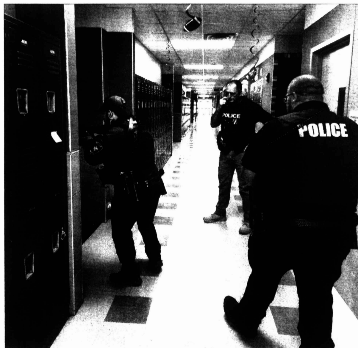
Active shooter training ... Members of the Tahoka Police Department spent several hours training for active shooter scenarios at Tahoka Middle School on Sunday.