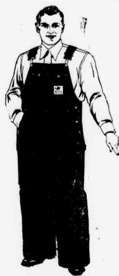
Boys Wichita Made Sanforized Overalls, pair

Every pair Sanforized shrunk... Made of 8 ounce denim in deep blue, Express and Chrome stripe... Graduated bib, fits you whether you are tall or short. New improved pockets with rounded corners... Nu-method style with no raw edges to ravel inside or out. Full, roomy double lined hip and rule pockets... Stream-line dome buttons that will not hang on projections... comfortable vest-back style... Sizes up to 50.