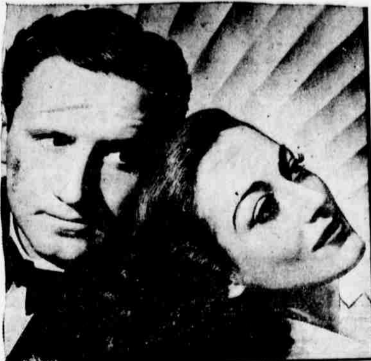
Spencer Tracy of "San Francisco" fame, and Joan Crawford whose latest triumph of "The Bride Wore Red" acclaims her anew, join to take the screen to new heights in "Mannequin" Thursday and Friday at the Texas Theatre.

there were official state support for an industrialization program. At present Texas efforts to attract industry and investments are confined to individual cities, chambers of commerce, and industries already here which naturally prosper in relation to population and tributary or associated industries.