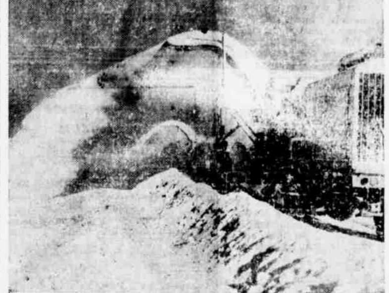
A unit of New York's mechanized snow army is shown gobbling up a seven-foot drift at Lake Placid, where the new equipment was first tried. This machine, it is claimed, can move 21 cubic yards of snow in 35 seconds.