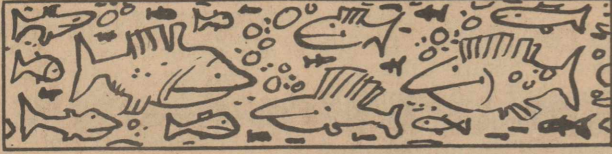
According to recent estimates there are about 40,000 different varieties of fish.

A very good time was had by all. Hope to see everyone again next year on July 18th and 19th.