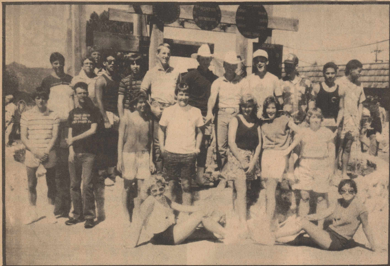
MONTANA TRIP: A group of nineteen Fisher County members of the Fisher County 4-H group were in Montana last week taking part in