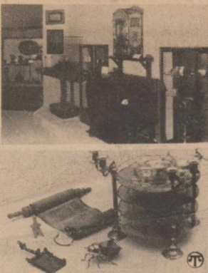
The Southwest's largest collection of Judaica contains artifacts spanning the period from 2,000 B.C. to the present.

As its collection has grown, the Fenster Gallery has attracted large numbers of visitors representing all religious faiths. It has regularly