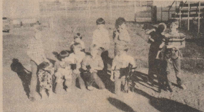
PET SHOW WINNERS

SUBSCRIBE By Calling 735-2562 Rotan Advance Roby Star Record