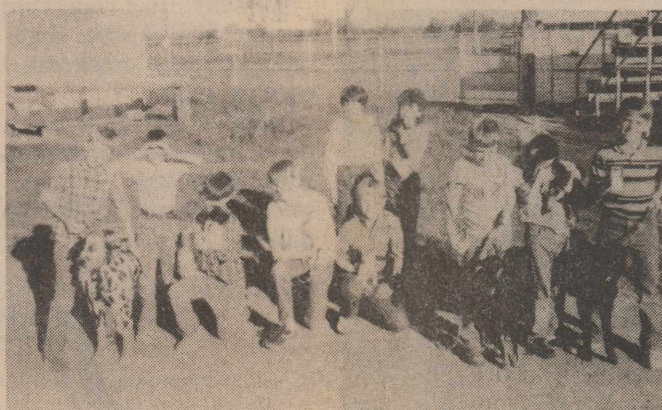
PET SHOW WINNERS