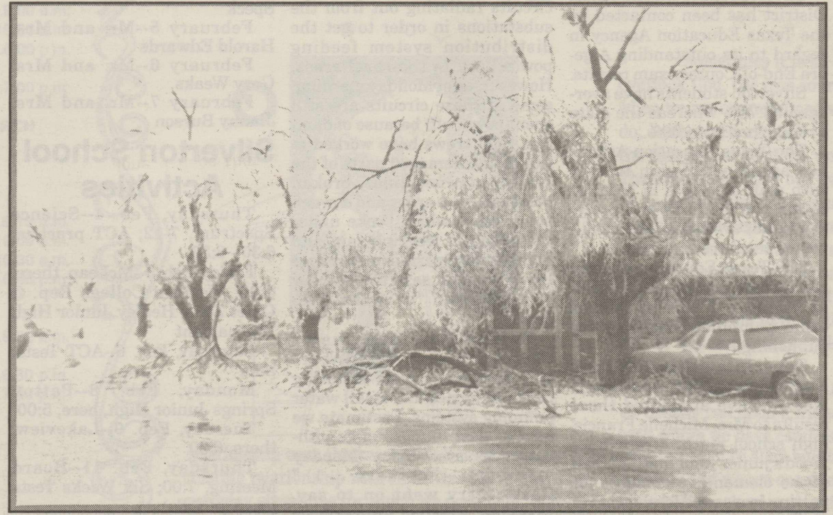
Two inches of rainfall froze on the limbs of trees in the Silverton vicinity over the weekend, causing limbs to come crashing to the ground beneath the weight of the ice. This picture was made at the home