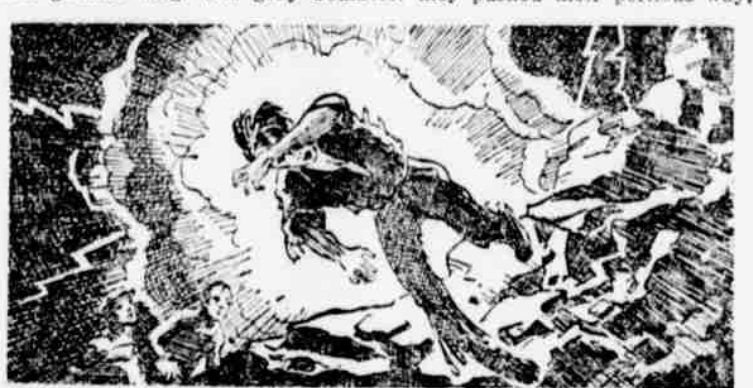
The Heavens Rocked With a Final Roar.

A frisky livery team took them to the foot of Mount Washington, 6,290 feet high. They began to climb. They reached the timber line, and patches of snow. The sun blased down and burned up the morning fog. The Atlantic ocean shimmered on the eastern horizon. The cog stantial improvements on the prerailway ground its way to the timber line terminal and the three pals mises. watched the arriving tourists with disdain. Upward and onward, over granite crags and gray boulders, they pushed their perilous way.