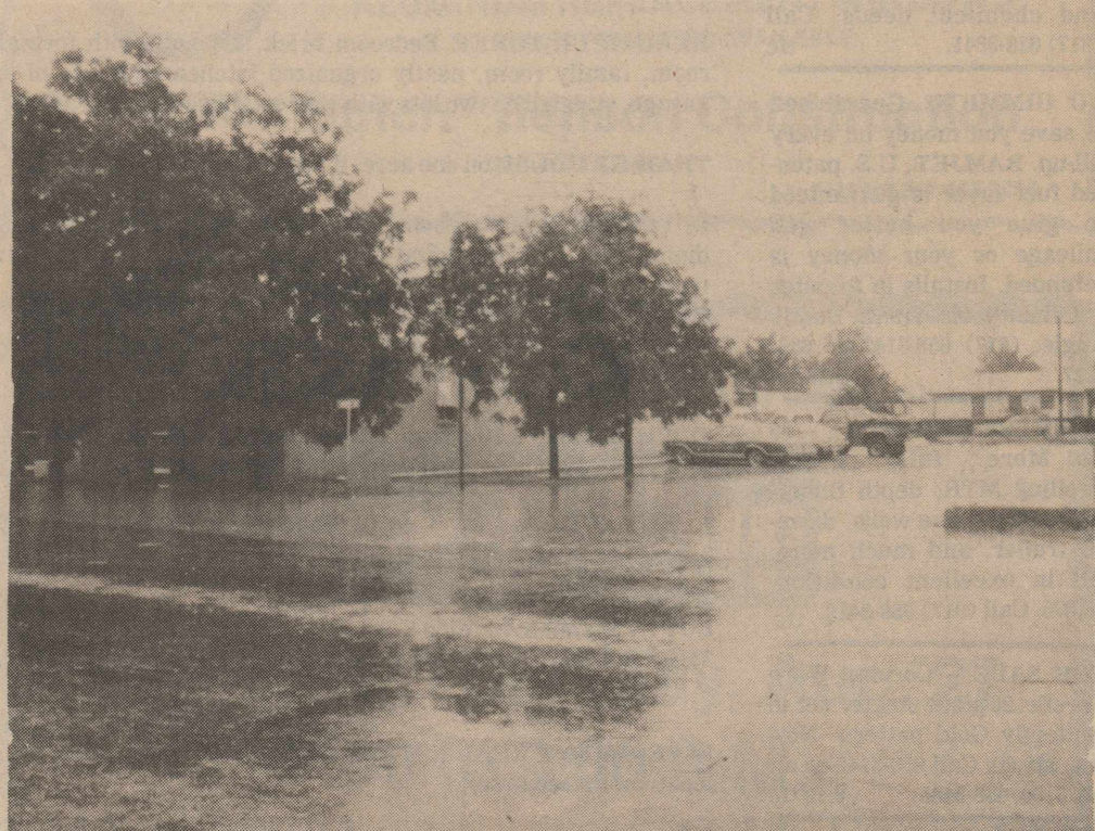
A BEAUTIFUL SIGHT to Knox City and area residents Monday afternoon was water standing in many places such as this location on Avenue J and East Main Street looking toward the Knox County Agricultural Offices. Hard rain brought 2.85 inches of rain to the town from about 1:00 p.m. until 3:00 p.m. Amounts were generally in the three-inch range around the area with gradually lesser amounts to the east of town. Farmers were all smiles as the much-needed moisture will greatly benefit the cotton crops.